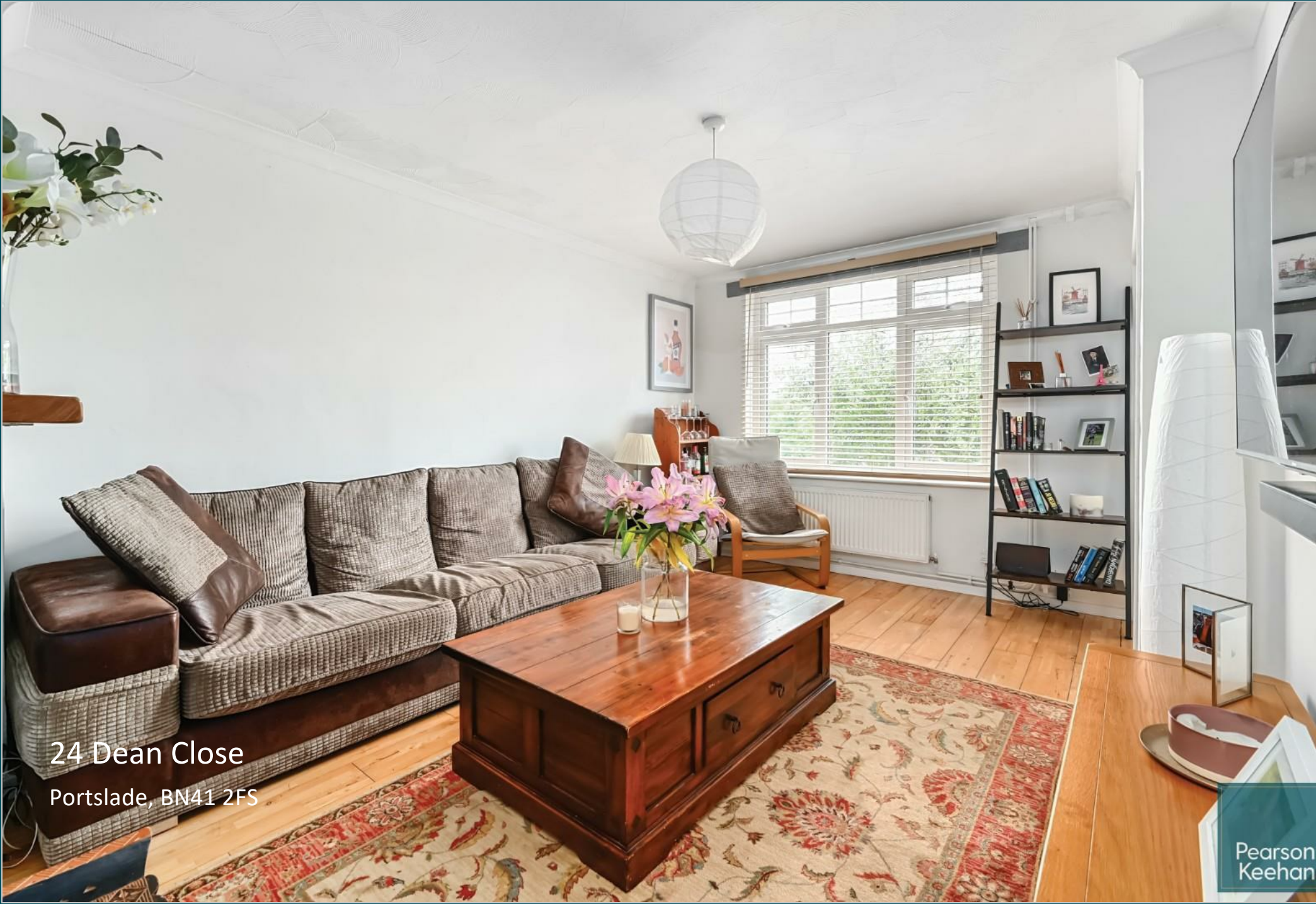
24 Dean Close Portslade, BN41 2FS